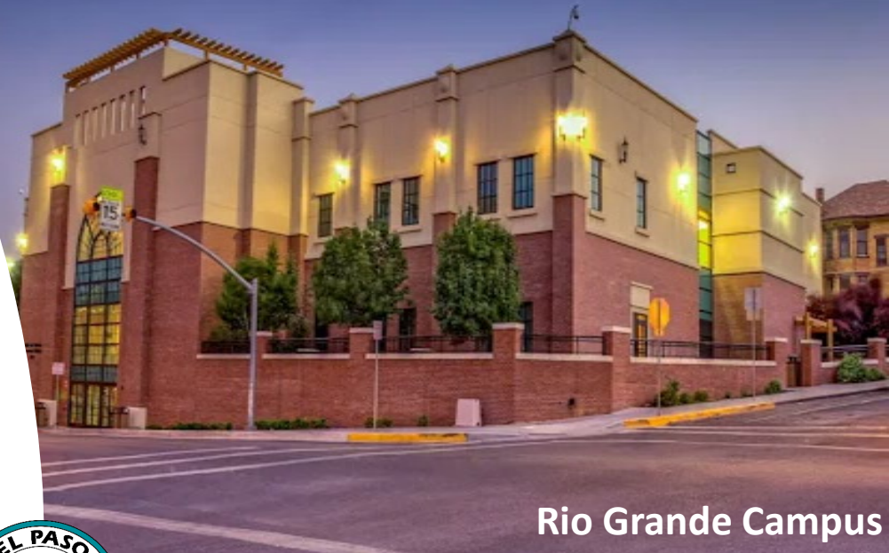
Rio Grande Campus