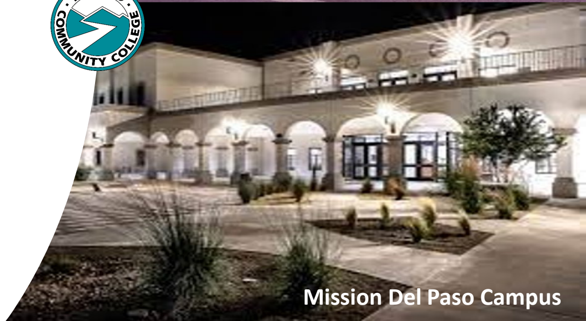
Mission Del Paso Campus

The El Paso County Community College District does not discriminate on the basis of race, color, national origin, religion, gender, age, disability, veteran status, sexual orientation, or gender identity.