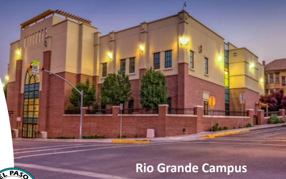
Rio Grande Campus