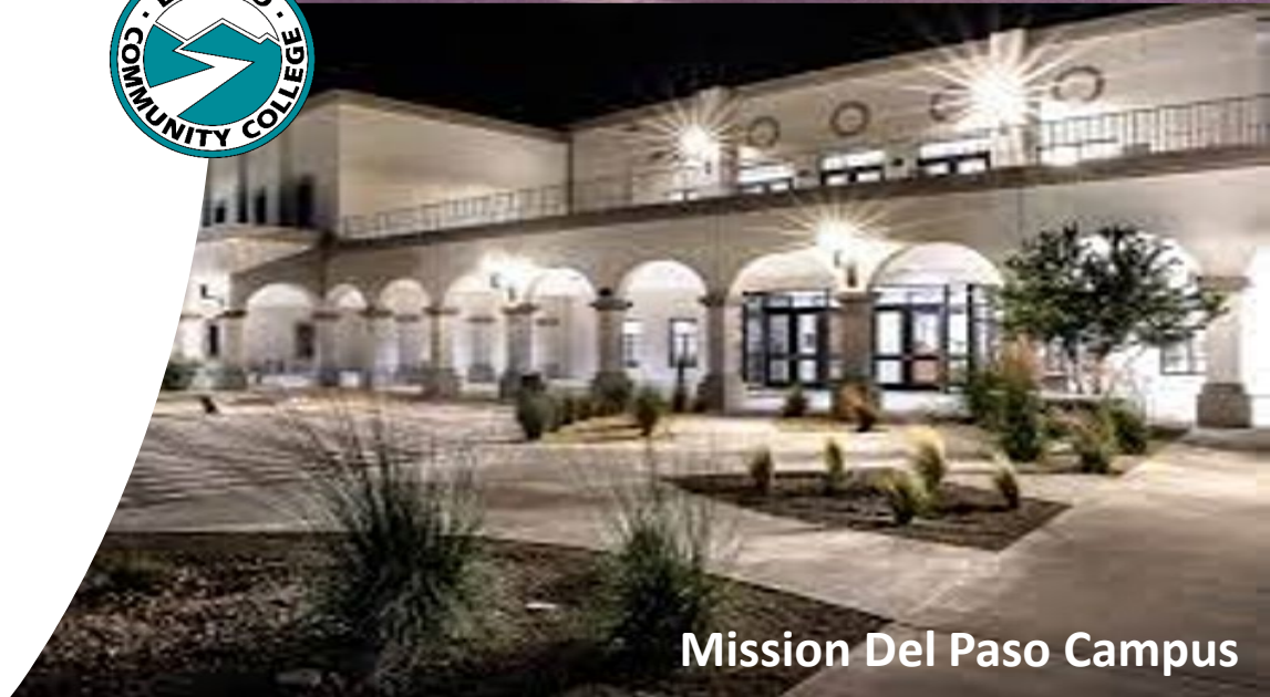
Mission Del Paso Campus

The El Paso Community College District does not discriminate on the basis of race, color, national origin, religion, sex, age, disability or veteran status.